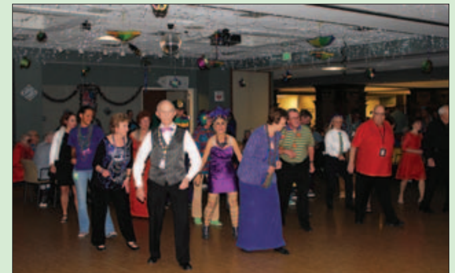
Residents and guests have a ball while line dancing at the Mardi Gras Ball.