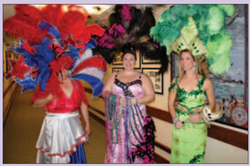
Beautiful Mardi Gras Maids handed out beads in the parade and Mardi Gras Ball.