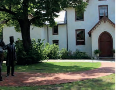
AFRH-W is the landmark site of President Lincoln's Cottage.

We'll help you achieve true wellness: a healthy balance of mind, body, and spirit to stay strong and build happiness. Enjoy a range of daily activities—from exercise classes, nutrition programs, and physical therapy to arts and crafts, regularly scheduled group daytrips, and live entertainment. Each day you can count on our dedicated staff for personal care and hands-on support.