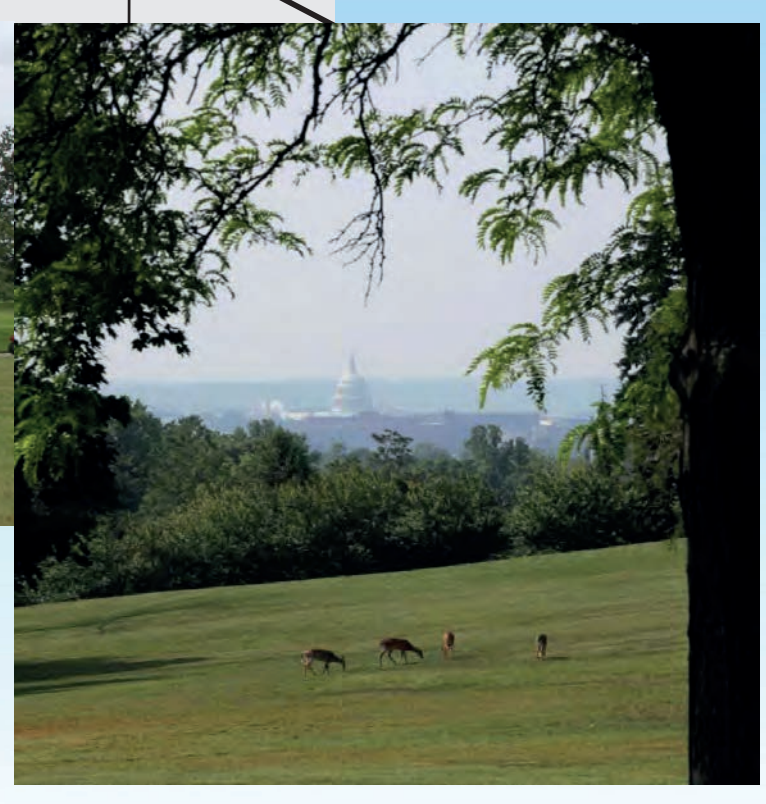
© 2019 Armed Forces Retirement Home. All rights reserved.

Email:public.affairs@afrh.govWeb:afrh.govFB:facebook.com/AFRH.govPhone:(800) 422-9988 opt. 1Fax:(202) 541-7519