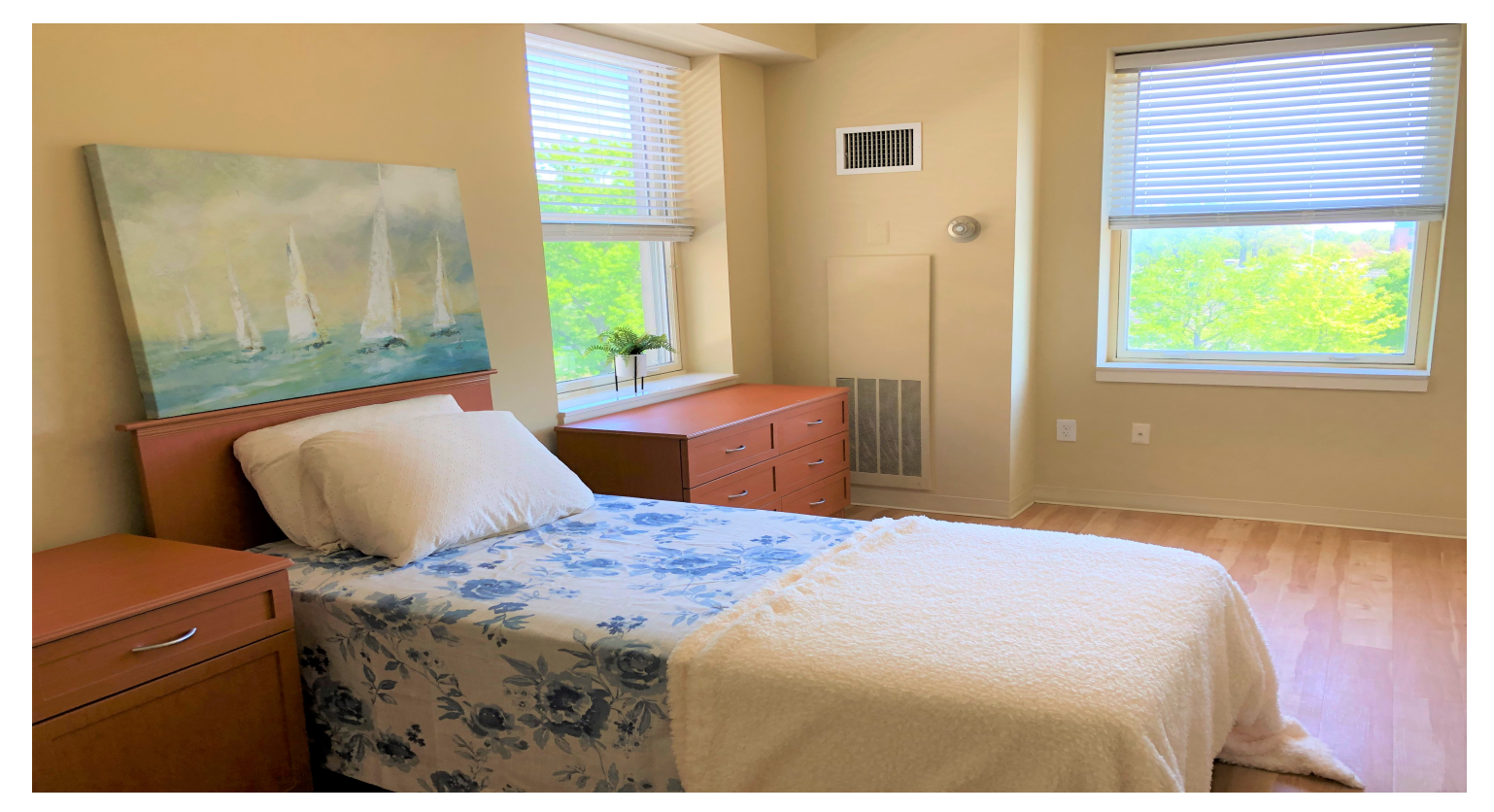
Single units feature a large closet and private bathroom. Married couples may have two adjoining rooms at AFRH-W as available.