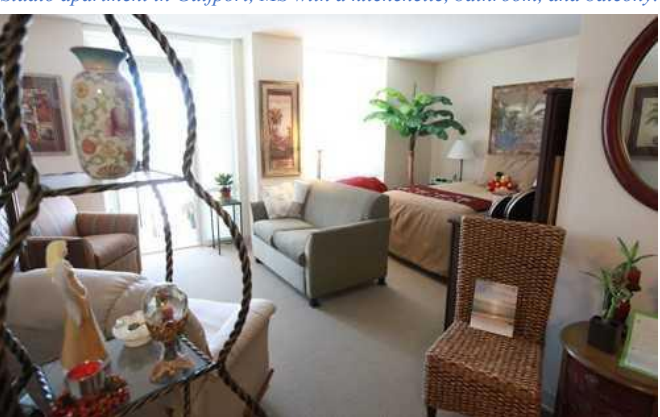
Studio apartment in Gulfport, MS with a kitchenette, bathroom, and balcony.

AFRH will help protect your legacy and prevent burdening your family with cost-of-care concerns. AFRH does not require long-term leases or purchase contracts. Our fees are based on your income, not your assets. The surviving spouse may remain a resident at the AFRH if the veteran passes away before their non-military spouse offering the peace of mind that your surviving spouse will not have to move again even if they do not meet the military requirements for residency on their own. Residents will not be discharged for an inability to pay.