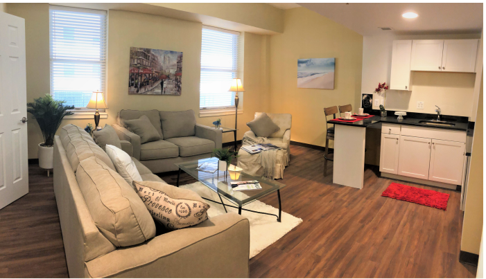
Living Room & Kitchenette in the couples' model suite in Washington, DC

Married applicants will be required to submit proof of eligibility including a marriage certificate and DD-214s. Veterans who are applying based on their own eligibility status who did not retire from active duty, will need to provide evidence of their service-connected disability or service in a war theater.