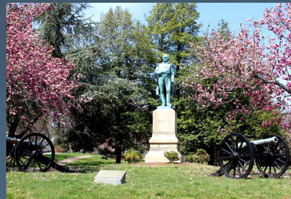
General Winfield Scott

Back in 1811, our young nation made a "Promise" to care for its older and disabled veterans. This would be repayment for their sacrifices in defending liberty. At last, two homes were built: the U.S. Naval Asylum (1834) and the U.S. Military Asylum (1851). The Naval Asylum provided a home for retired sailors in Philadelphia until 1976 when the home was relocated to Gulfport, Mississippi. General Winfield Scott, a hero of the Mexican-American War, provided funding to Congress to open a home in Washington D.C. for old and infirm soldiers. In 1991 both retirement homes joined forces and became the Armed Forces Retirement Home.