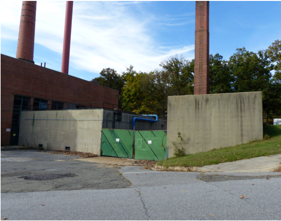
Image 4: Building 69 – Storage Contamination Building (Contributing, Minor)