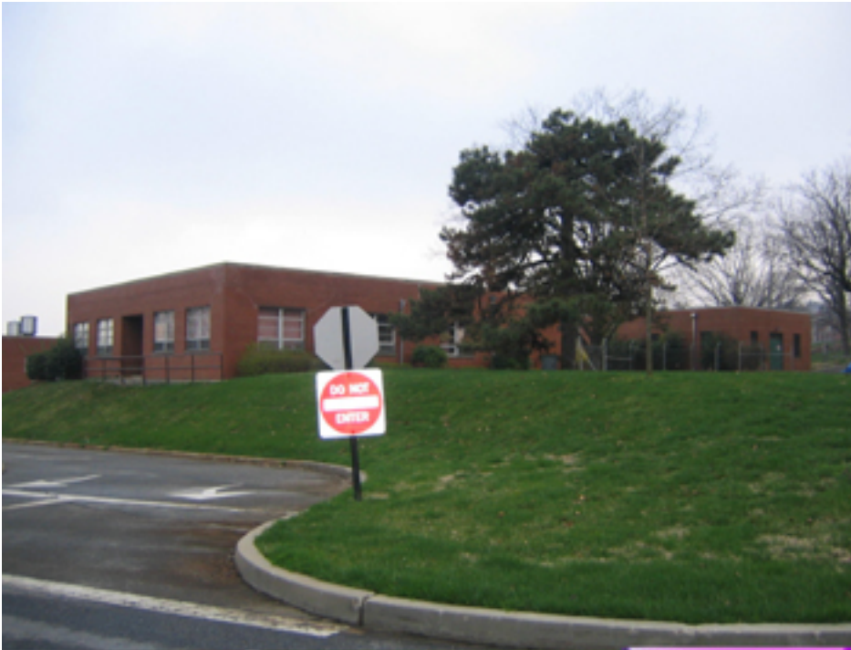
Image 5: Building 70 – Support Directorate Building (Non-Contributing)