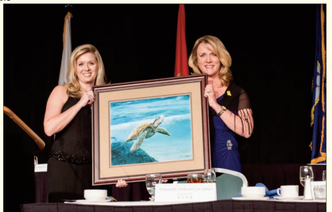
U.S. Air Force Secretary Deborah Lee James (right) holding the "Gulf Turtle" print at The Salute to the Military.

Y'all keep looking for those opportunities, for both artist and viewer...Art is an Adventure.