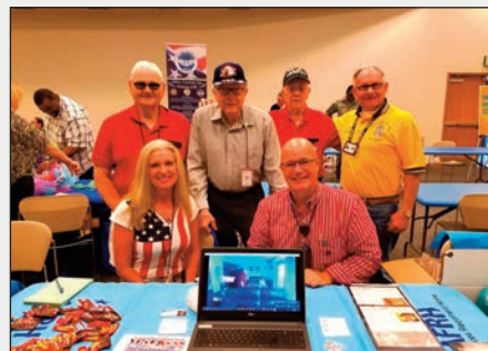
Residents from the Gulfport Home even stopped by for a visit.