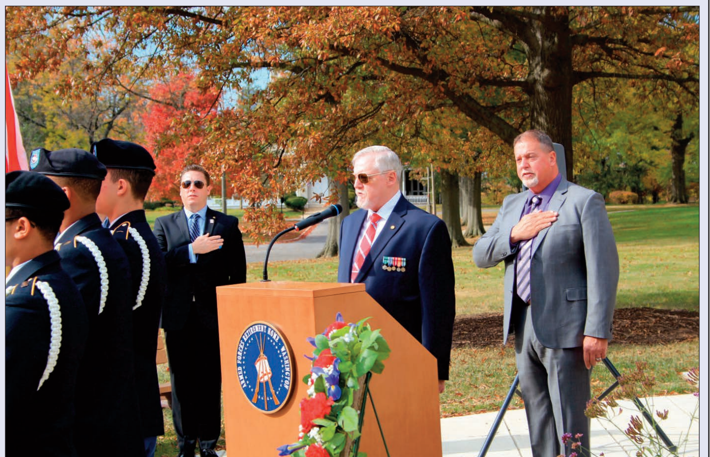
Attendees stand for the National Anthem.