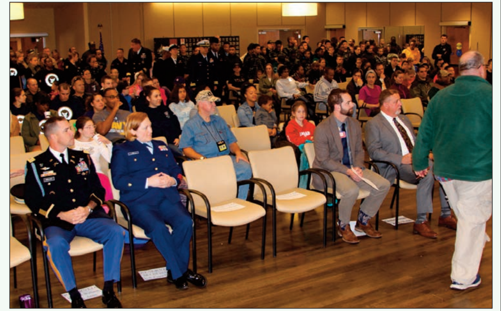
Volunteers gathered in the Community Center to receive their assignment for the day.