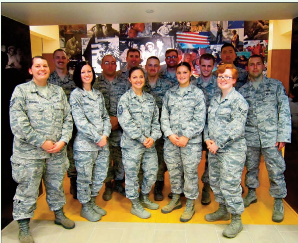
Thank you to the 81st MDOS Bingo volunteers.

We look forward to a return visit as it was a winning experience for all involved.