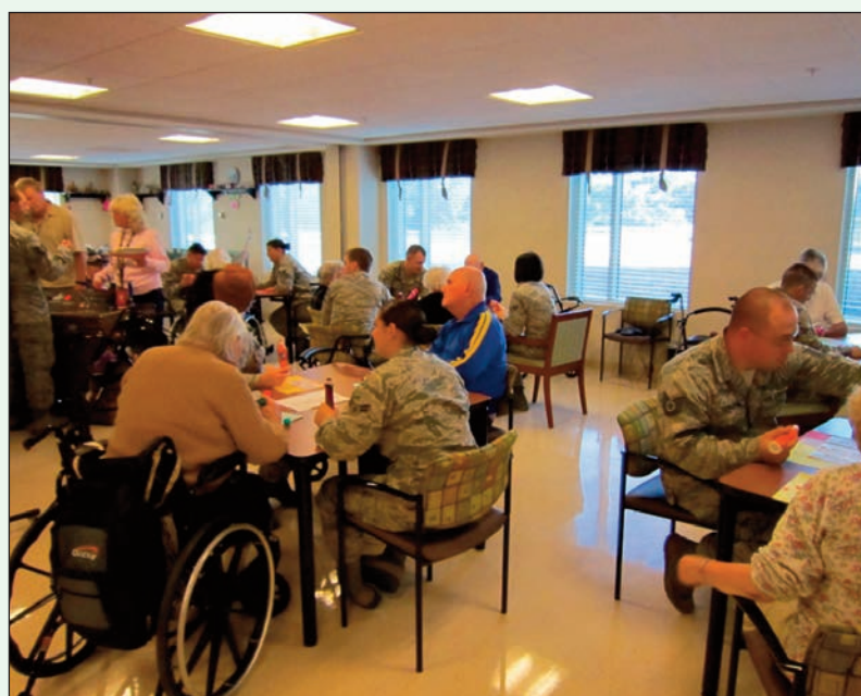
It was a winning day!