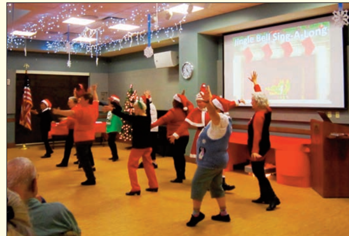
The Dixie Line Dancers getting jiggy with it!