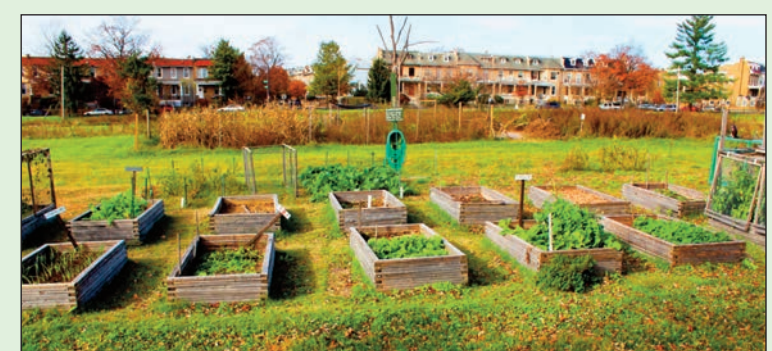
Residents sign up for garden plots each season.