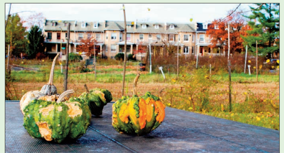
Pumpkin squash are a popular harvest at AFRH-W.