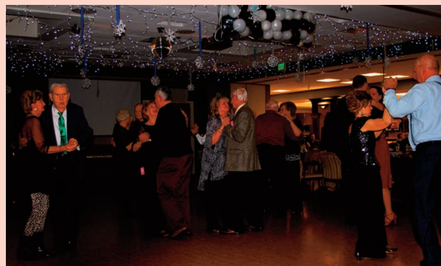
Residents and guests "boogie" to the music.