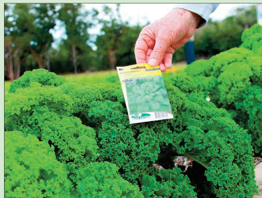
This is the packet of seeds he brought back from Holland.