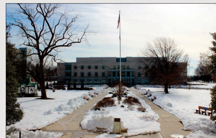
View of the Scott Building, after the storm; with exceptional snow removal thanks to Campus Operations.