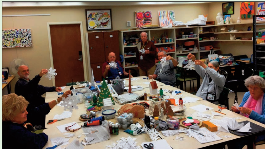
Resident Volunteers making paper snowflakes to decorate the Community Center for the holidays.