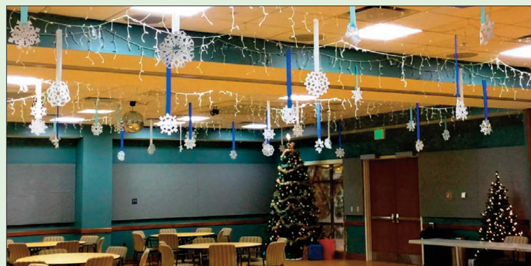
The finished product. Look!!! It's snowing.