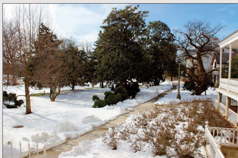
View of President Lincoln's Cottage after the blizzard.

Recorded as the fourth worst storm amongst northeast storms in the past 100 years, Winter-storm Jonas brought a blizzard of snowfall affecting over a hundred million people. According to the New York Post, Washington, DC saw about 18 inches of snow. The Office of Personnel Management closed federal agencies in the area for three consecutive days, following the storm.