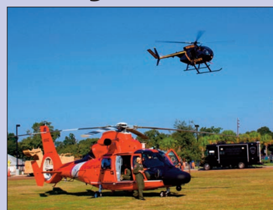
The US Coast Guard and a Harrison County Sheriff's helicopter landed on the front lawn of AFRH.