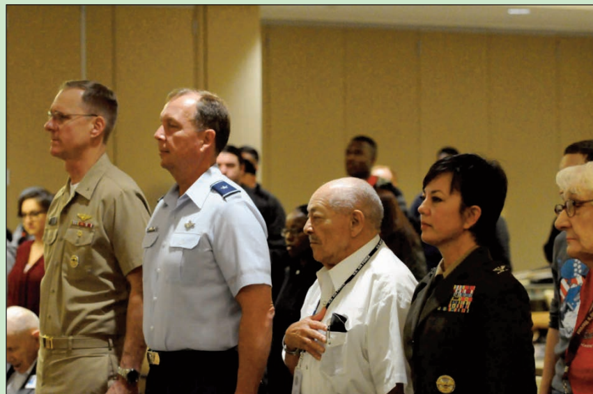
Attendees stand for the National Anthem.