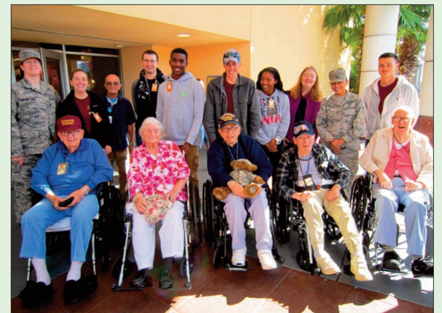
Christmas shopping here we come!

On Friday, November 13, 2015 Residents from Valor, Loyalty & Allegiance Hall enjoyed a day of shopping. The trip began with a stop to the Dollar Tree for bargains and then onto Edgewater Mall for more shopping treasures. Residents enjoyed window shopping, strolling, and visiting with AFRH community volunteers, resident volunteers, and military volunteers from KAFB Medical Pharmacy and KAFB 338th TRS Dark Knights. With a chance to take a shopping break, residents chose a variety of treats from the food court and continued to visit over lunch. After being refueled, residents again hit the mall to find the last items on their lists. We thank our amazing volunteers for a wonderful outing and we look forward to a bright holiday season!