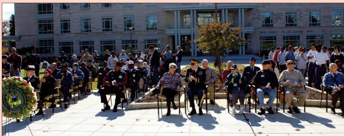
Residents, staff, family and guests gather outside the Scott Building to honor Veterans.