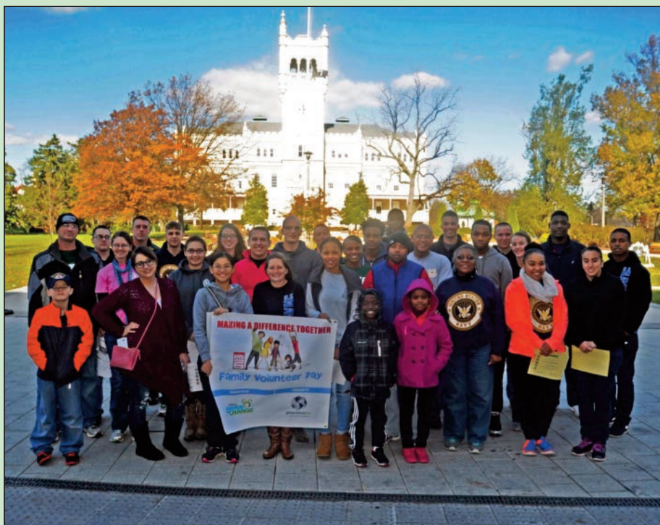
Volunteers from Naval District Washington's community service office in front of the historic Sherman building.