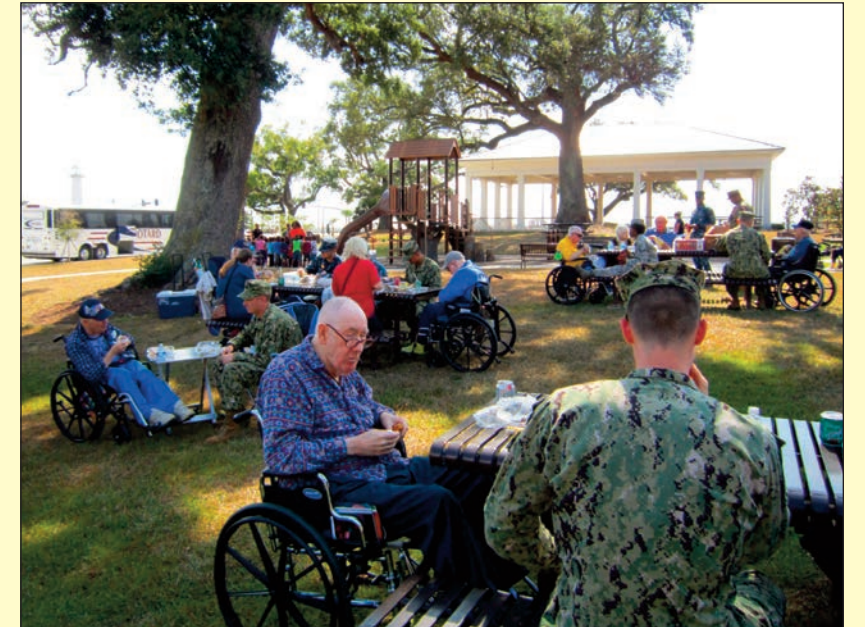
Residents have a fabulous picnic in the park!