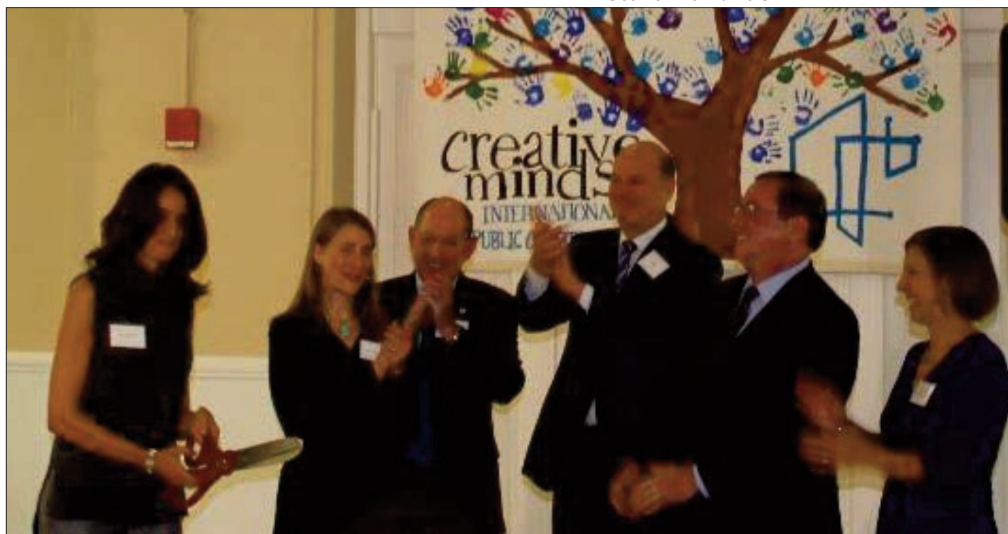
Creative Minds International Public Charter School held its Ribbon-cutting Ceremony at the AFRH-W North Sherman Building. The school signed a 10-year lease to use a portion of the Sherman building. This is just one of the plans we have to utilize the land on the property in D.C.

My hope is that you will all continue to work with the leadership of this Agency to keep AFRH at the forefront of service to you, America’s greatest heroes. I have no