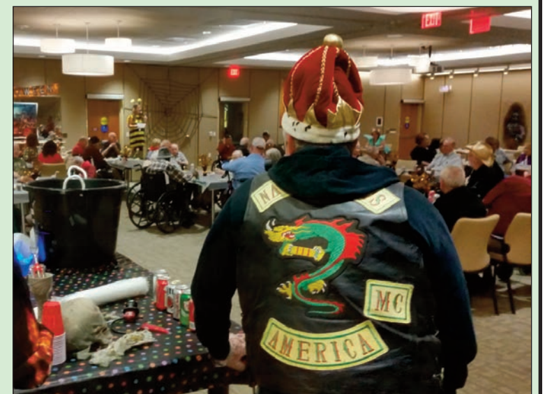
The Nam Knights volunteer monthly at AFRH-W.