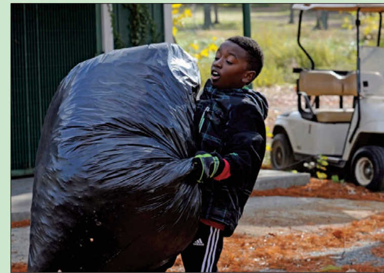
Small, but a mighty volunteer carries a full bag of leaves out of the campus garden.