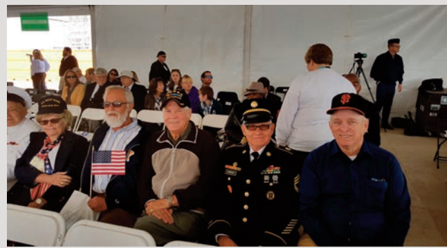
Gulfport Residents enjoyed the Christening of Munro in Pascagoula, Mississippi.