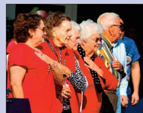
Residents and guests attended the ceremony & open house.