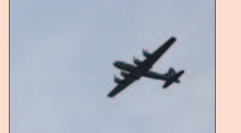
FiFi is the only known B-29 still flying the skies.