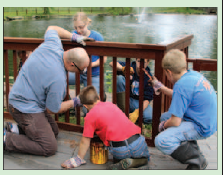
The Coast Guard family pitches in to help stain the railing on the bridge.