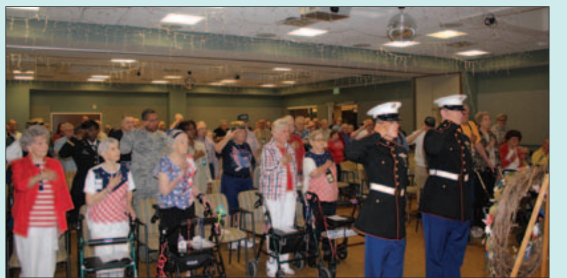
The Gulfport High School JROTC assisted with the placing of the Memorial Wreath.