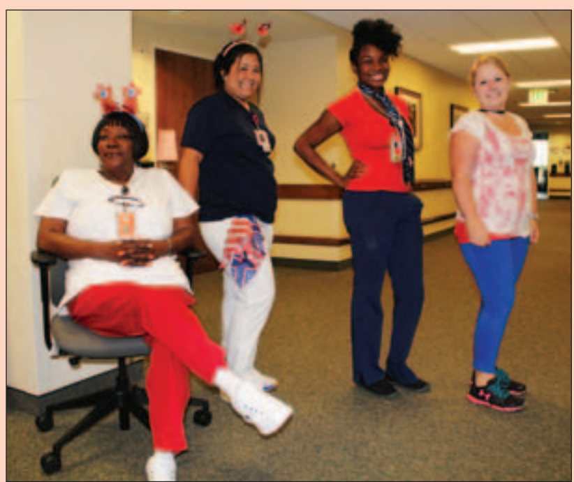
The Nurses of Valor Hall and Loyalty Hall celebrated Patriotic Day at AFRH-G.

When you're a nurse you know that every day you will touch a life or a life will touch yours.