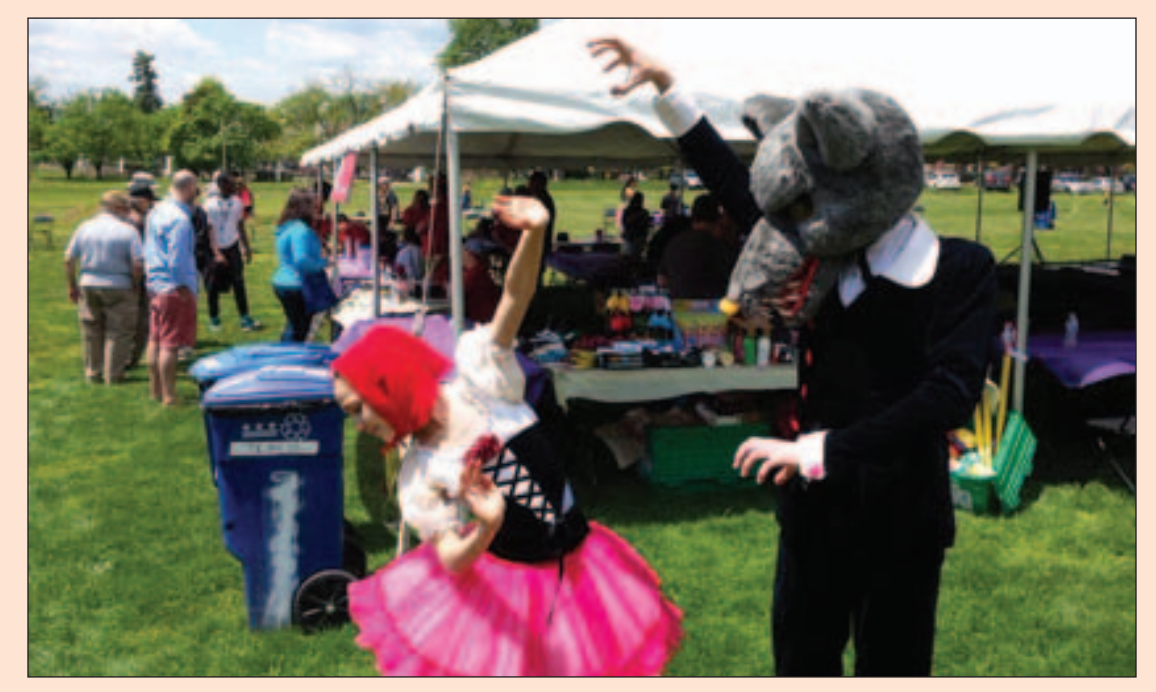
Entertaining the children during Spring Fling were Little Red Riding Hood and the Big Bad Wolf.

The Friends of the Soldiers' Home hosted the 3rd Annual Spring Fling on May 2, 2015 on the lower grounds of the Armed Forces Retirement Home-Washington. This year's event featured nature walks, games for the kids, food trucks and live entertainment.