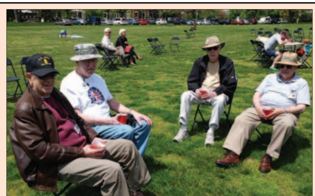
Residents kick back and take it easy at this years event.