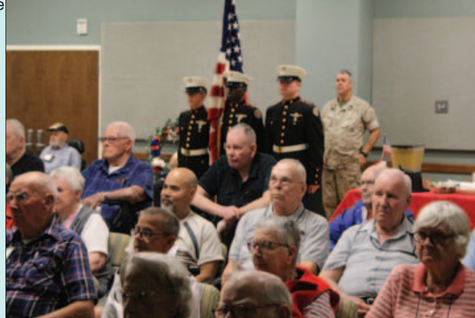
The Gulfport High School JROTC posted and retired the Colors.