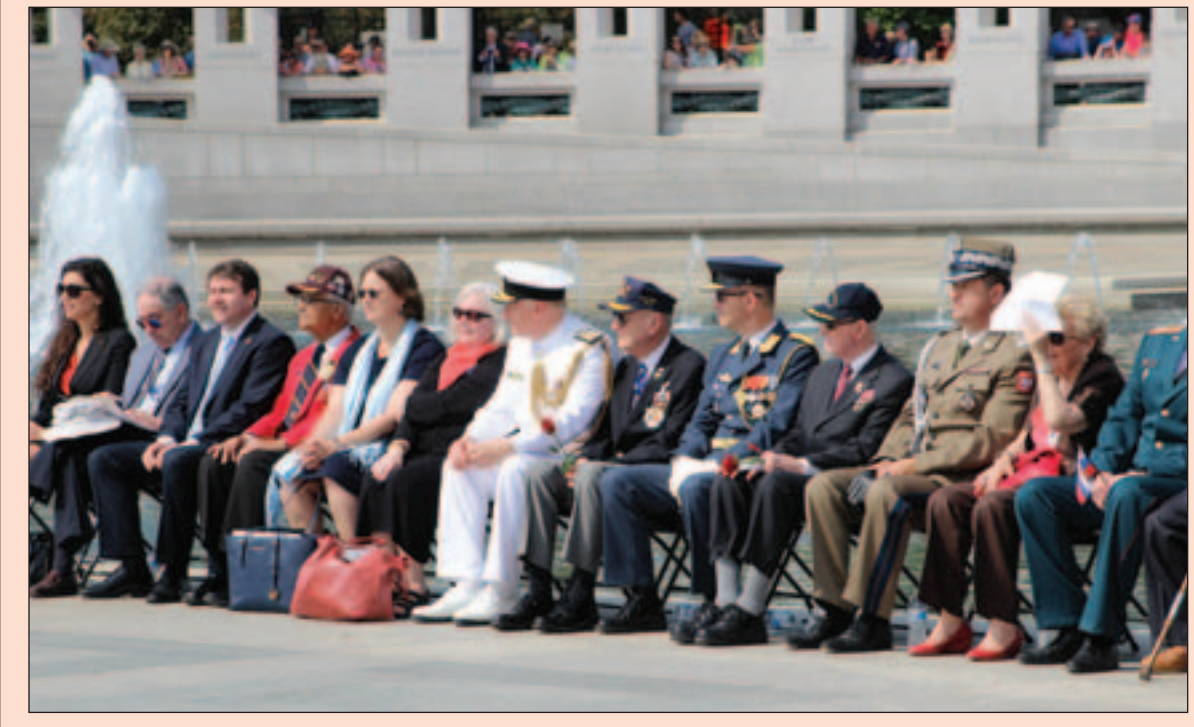
WWII veterans along with representatives from over 30 countries attended the 70th Anniversary of V-E Day at the WWII Memorial.