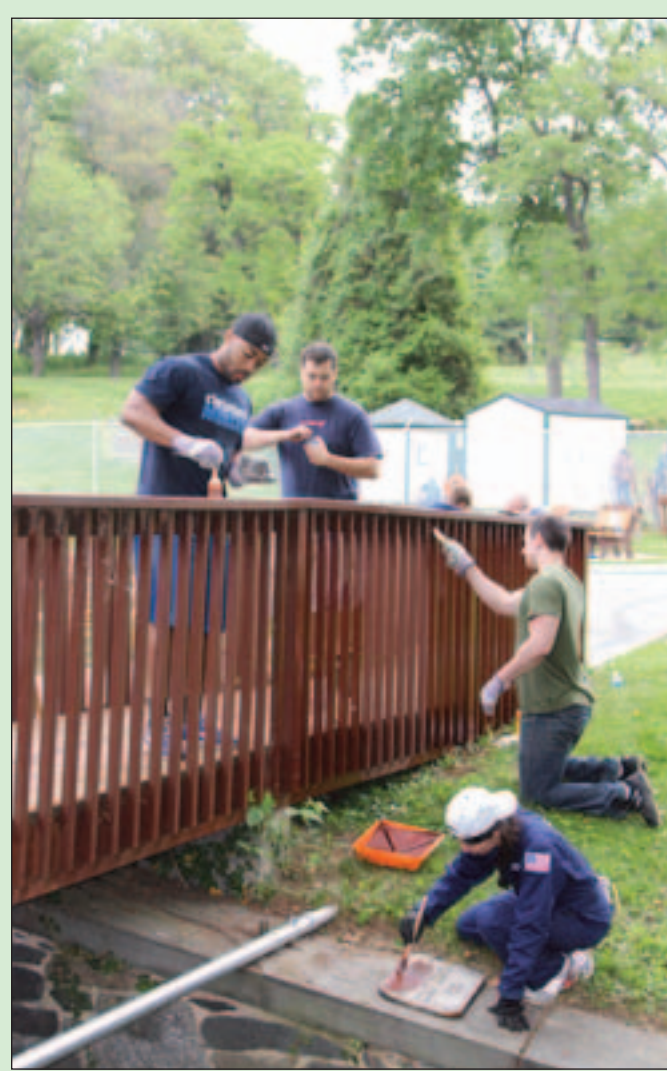
Coast Guard personnel place a new coat of stain on the bridge.