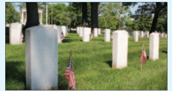
US Soldiers' & Airmen's Home National Cemetery.