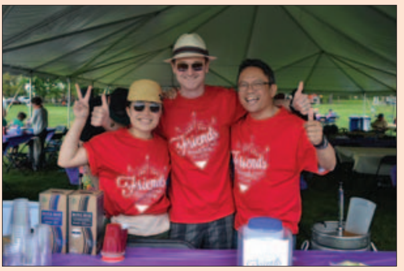
Volunteers of Friends of the Soldiers' Home serving up refreshments.