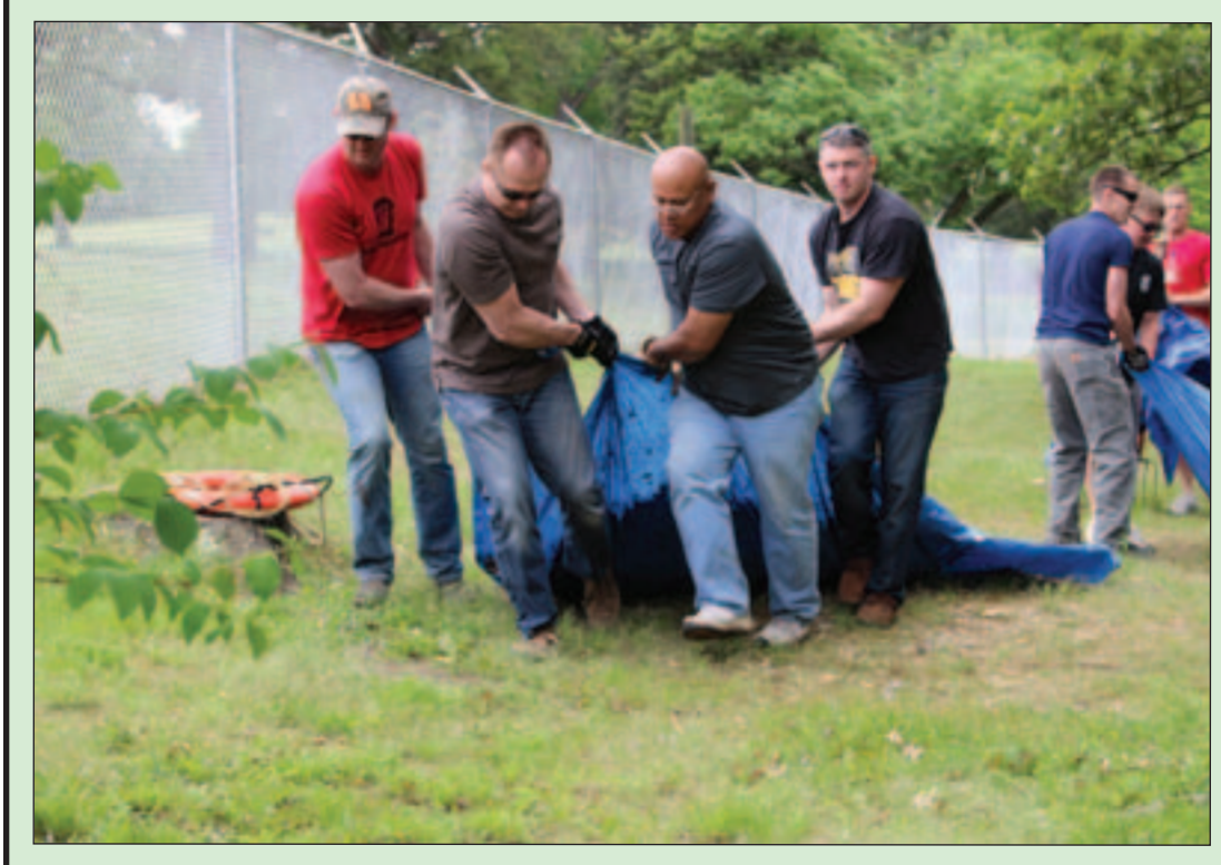
Coast Guard volunteers dragging just one of the several piles of leaves out of the pond area.

Thank you Coast Guard for all of your support!