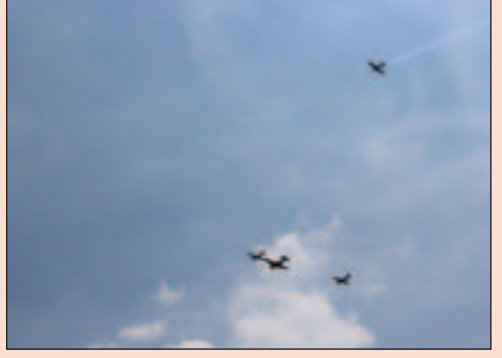
The missing man formation