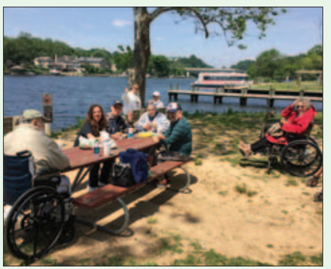
Residents enjoying lunch on the bank of the Occoquan River.