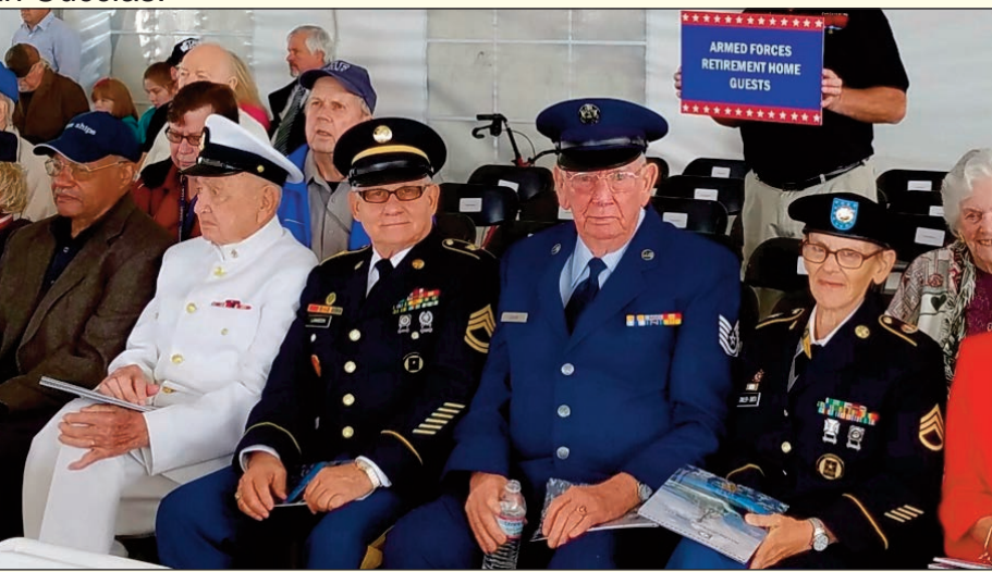
Pictures of the Residents attending the Christening of the USS Johnson at Ingalls Shipbuilding yard Pascagoula, Mississippi 2 April 2016.