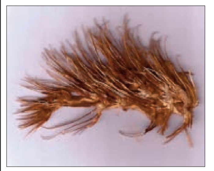
Can you guess what this is? Stay tuned for the answer in May's Communicator.