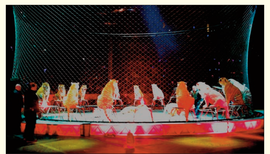
A trainer was in the center of the ring surrounded by 16 tigers.