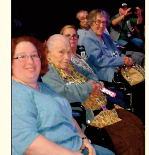
Residents and staff enjoy the Barnum and Bailey Circus.