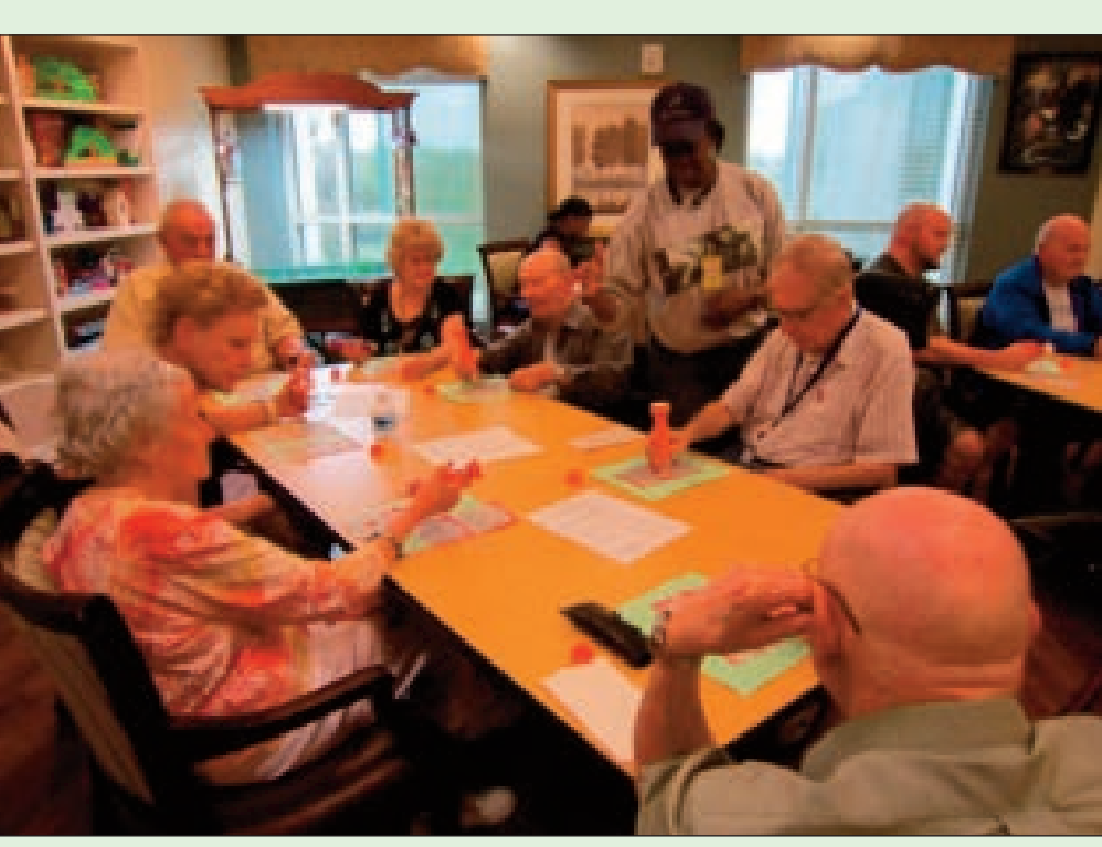
It was a winning afternoon with MPACT's Bingo! MPACT is the MGM Resorts Beau Rivage employee program. Employees of the Beau Rivage provide community outreach and service to others to make a difference in Mississippi.

As a community partnership, MPACT returns every 4th Thursday to assist with bingo games and visiting with Residents. These monthly experiences have truly made an MPACT on our veteran Residents and volunteers!