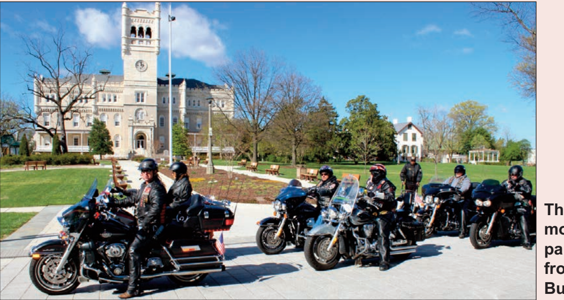
The Rolling Thunder motorcycle club pauses for a photo in front of the Sherman Building.