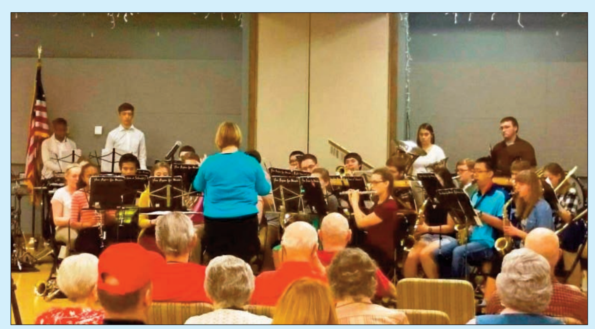
East Duluth High School from Duluth, Minnesota put on an awe-inspiring orchestral concert featuring strings and brass.