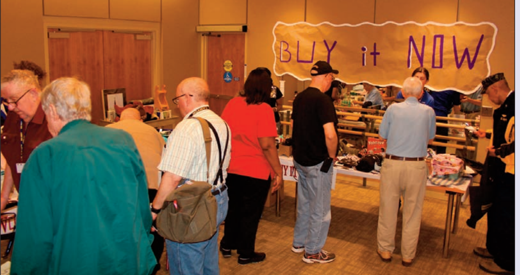
Residents use their money to purchase donated items.