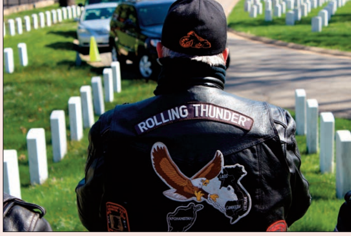
A member of the Rolling Thunder motorcycle club at the Memorial.